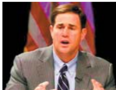
Gov. Doug Ducey