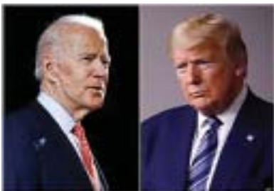
Joe Biden Donald Trump