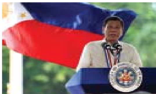
President Rodrigo Duterte

President Rodrigo Duterte on Friday urged the Filipino people to move forward with cour-